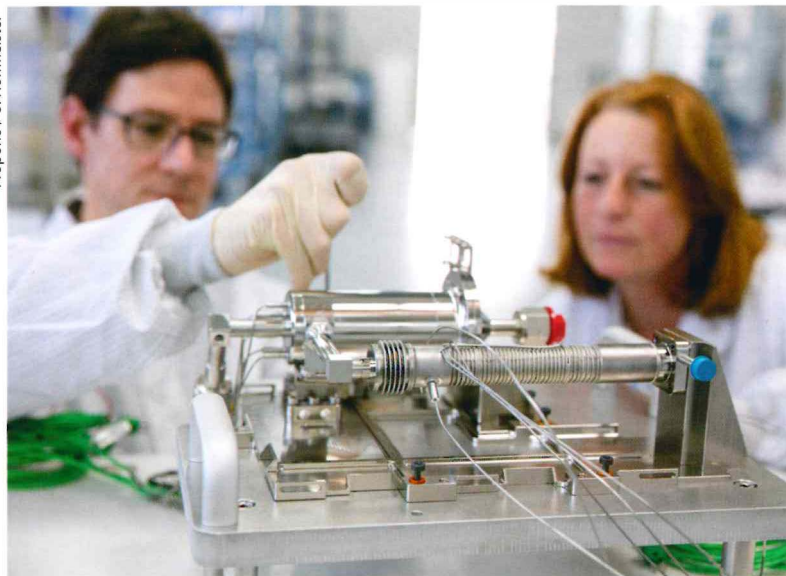
Fig. 1 Assembly work on the Sabatier reactor, the centrepiece of Drawer #4,

In addition to producing individual components for Drawers #1 and #2, PINK was entrusted with the (partial) engineering and production of the technical centrepiece of Drawer #4, the Sabatier reactor. Furthermore, PINK produced the complete Drawer #6 (Fig. 2) – the module for oxygen generation by electrolysis – with all the mechanical connections and pipework ready for installation (plug & play). The electrical wiring was integrated in an intermediate step by Airbus staff in PINK's cleanrooms in close cooperation.