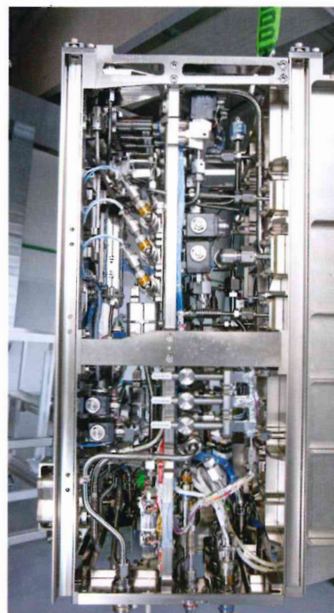
Propono / U. Hoffmeister

What made the engineering and production of the ACLS subassemblies particularly challenging was the fact that the technical preconditions for the separation and chemical treatment processes had to be established in extremely confined space. For the resultant super-compact systems, PINK specially had to develop novel assembly strategies. Thanks to a strict methodical chain of precision manufacture, cleanroom assembly, quality control and documentation, it was possible to successfully conduct integration, tests and (partial) verification of the Engineering Module and Flight Module together with the customers in PINK's cleanrooms.